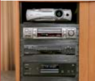
Unobtrusive in the meeting.