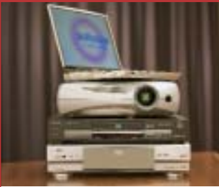
Connect to multiple computer and video sources.

Full connectivity and control are yours, in a solutions-enabled design that lets you install the projector in almost any room configuration or move it between rooms.