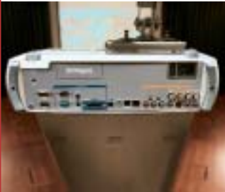
Mount it on the ceiling, or keep it mobile.