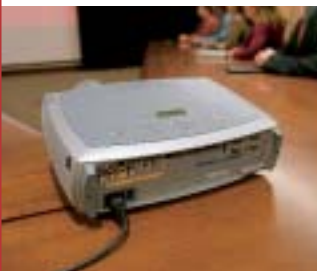
Connectivity for maximum collaboration.